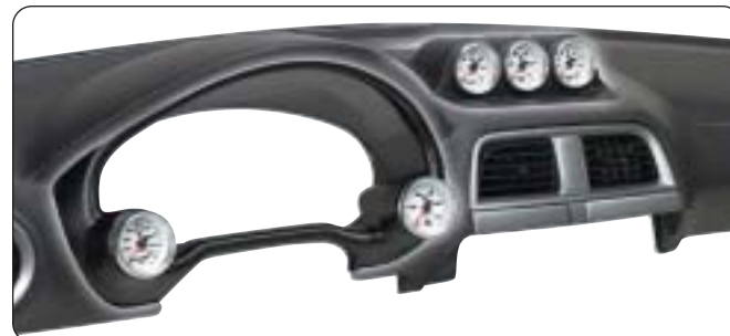
Dual Instrument Cluster Bezel

Note: Gauges not included with any pods.