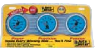
7200 Shown Illuminated

Each pack includes Water Temperature, Voltmeter and Oil Pressure gauges.