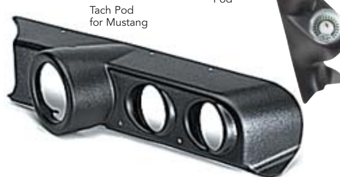
Tach Pod for Mustang