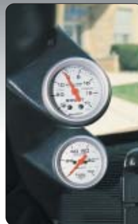
Dual Pillar Pod