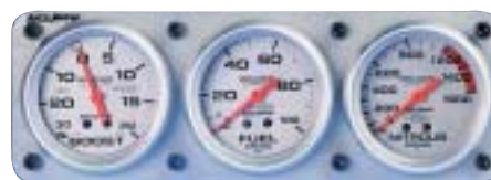
Gauge Cage (shown in silver)