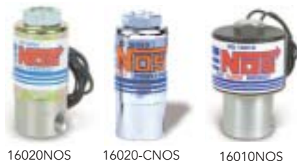
16020NOS 16020-CNOS 16010NOS