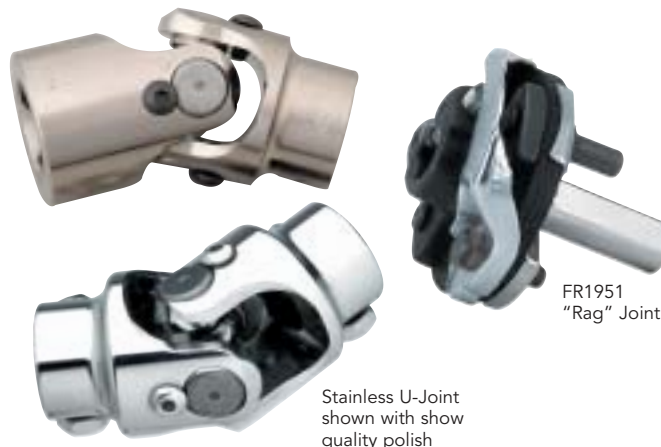
FR1951 "Rag" Joint

Stainless U-Joint shown with show quality polish